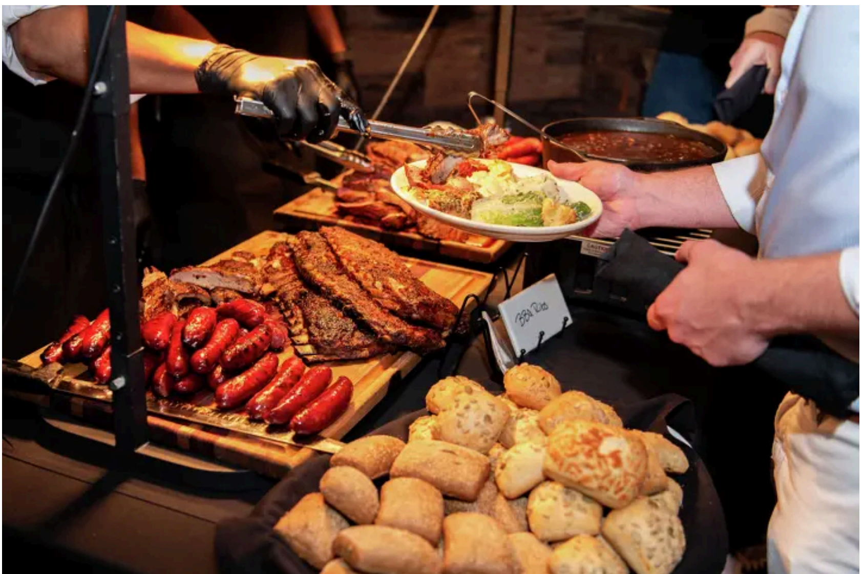
At Haywire, the Mother's Day spread will include chef-carved meats, seafood, a taco station and breakfast dishes.

Georgie is at 4514 Travis St., Suite 132, Dallas. georgiedallas.com .