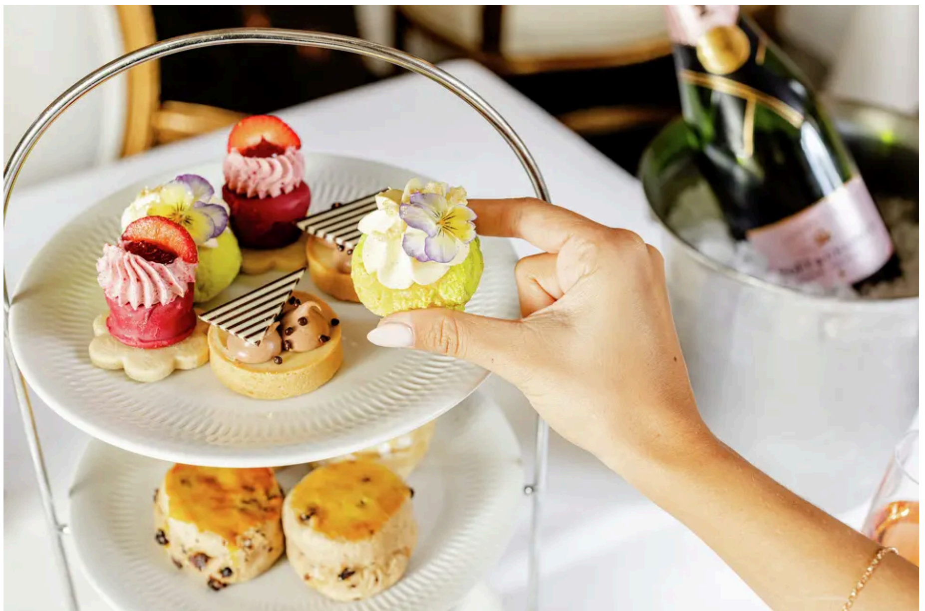
The Adolphus will host a Mother's Day brunch buffet in its Grand Ballroom. Kayla Enright